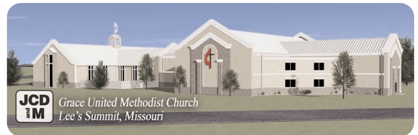
Architectural Rendering of the current church (left) with the new Sanctuary addition

A: At this time we are asking you to prayerfully consider your participation in the process. Much additional information will be forthcoming in the next few months that should answer any remaining questions and most of all we hope that each and every family can find comfort in knowing that all gifts are truly a blessing to a very worthwhile cause.